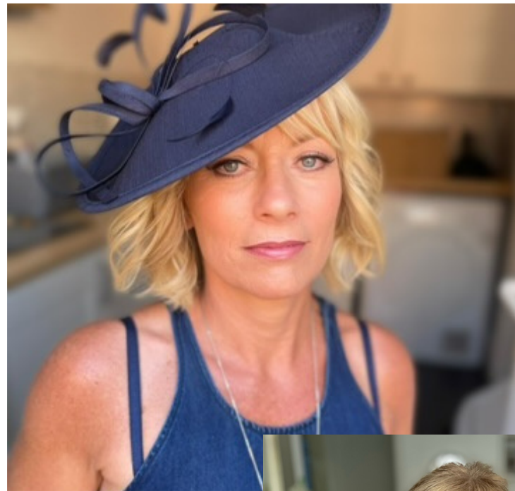
All Hair & Make-up Beauty Ninjas.